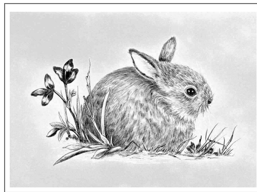
Art by Bonney Kuniholm

(See request for archival materials on page 8.)